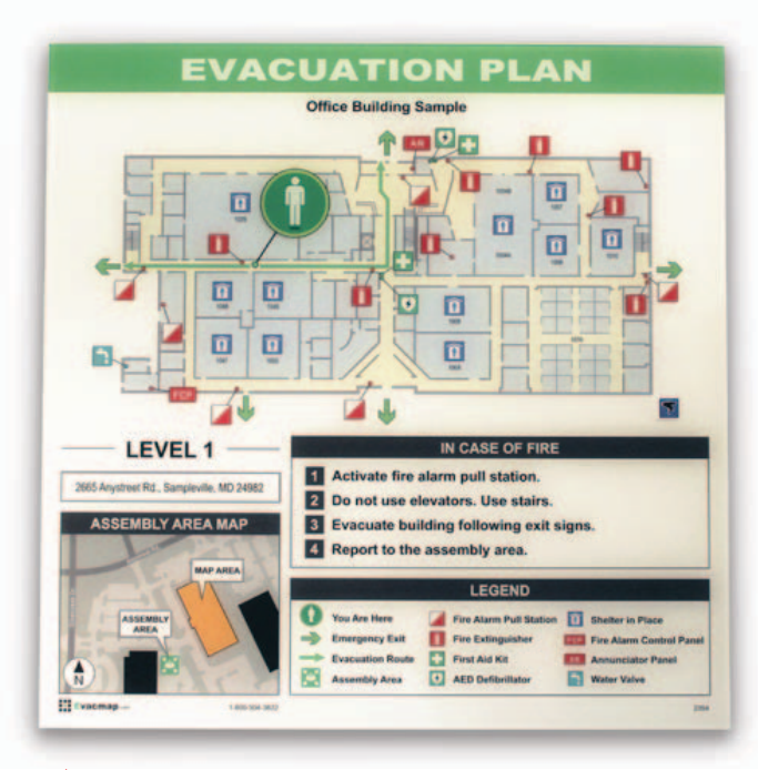
★ Our Most Durable Plaque